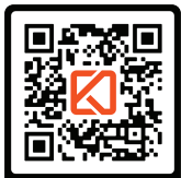
KRATOS QS IOM MANUAL

The AI GenDock is a great supplement for packagers of: